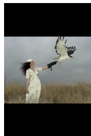
Rosetta Getty Resort 2024