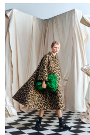
Erdem Resort 2024