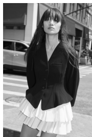
Ashlyn Resort 2024